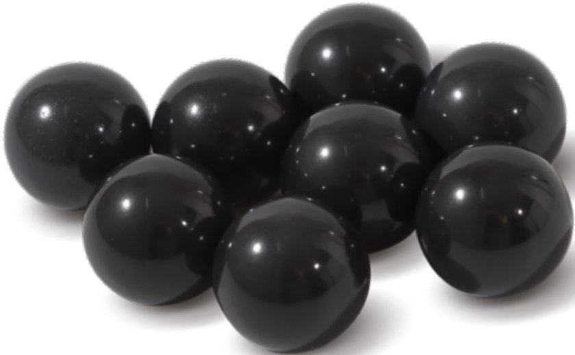
Grinding Balls 10mm diameter